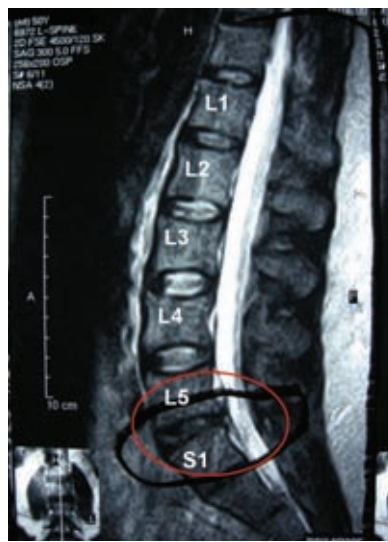
Figure 1b: Post-treatment MRI (14/03/05)