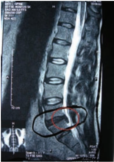
Figure 1a: Pre-treatment MRI (02/02/05)